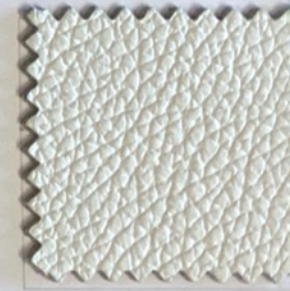
370 BIANCO PURO