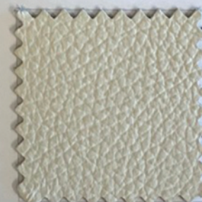
93 BIANCO LATTE

For everyday cleaning a wet cloth can be used without rubbing. In case of stains, use distilled water and mild soap. It is recommended to let it dry naturally, and avoid the use of artificial heat sources.