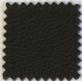
327 GRIGIO SCURO