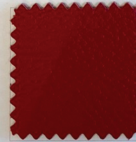
150 ROSSO CARMINIO