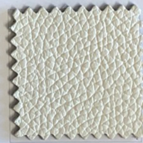
101 BIANCO NATURALE